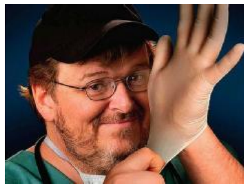
Film-maker Michael Moore poses for his new film "Sicko"